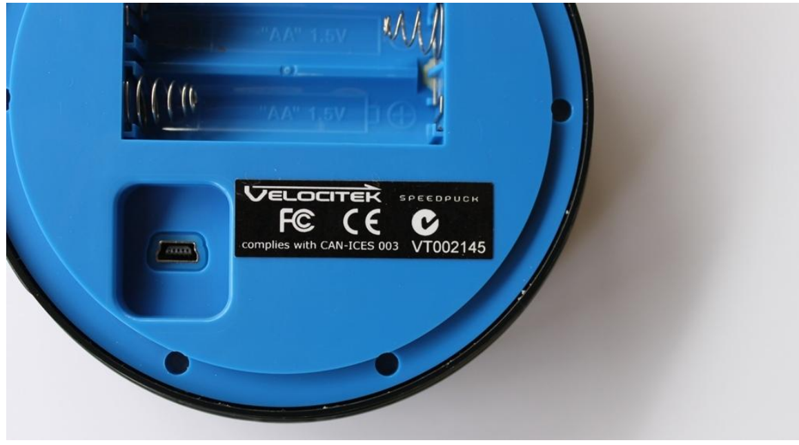
Figure 2 The Serial Number (VT002145) is on the sticker in the battery compartment.