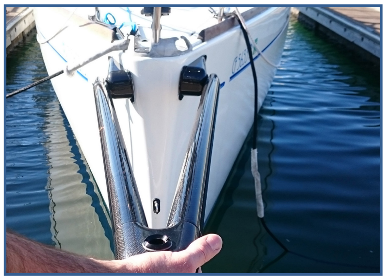
Fig. 1: Place bowsprit with mounts attached on the hull to determine location

Carefully tighten the nuts. Torque until snug, but do not overtorque.