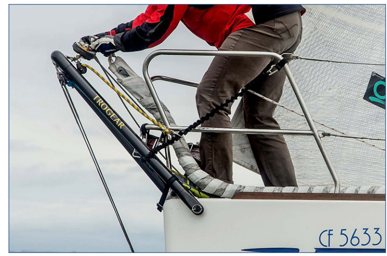
Fig 3: Bowsprit in upright position to attach a furler.