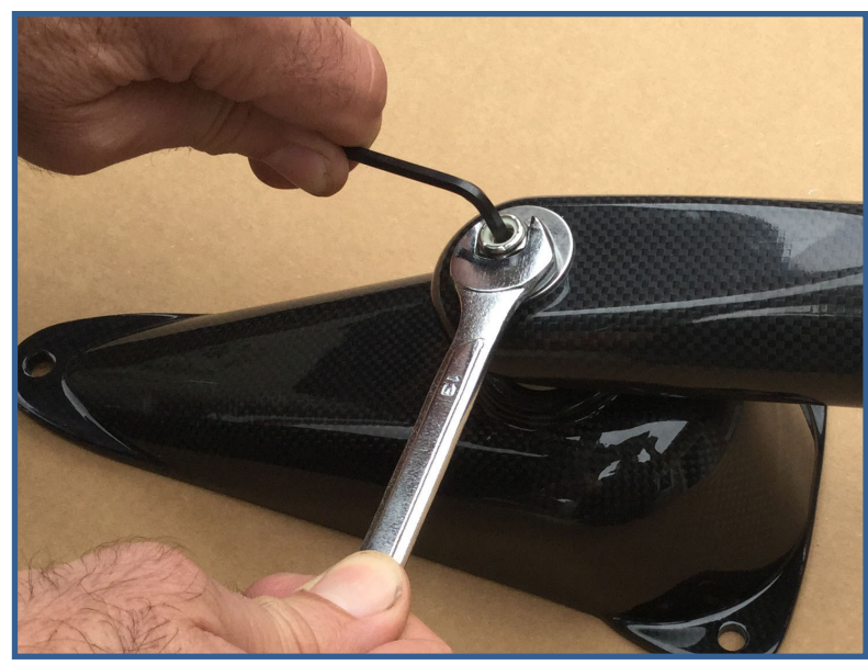
Fig. 2: Use allen wrench to prevent stud rotation