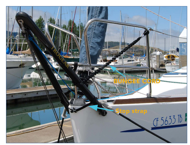
Fig 4: Showing Bungee Cord and Stop Strap.