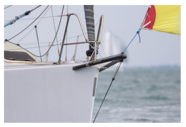
Through Hull – The neatest and best solution but does require bonding a glass fibre tube through the bow