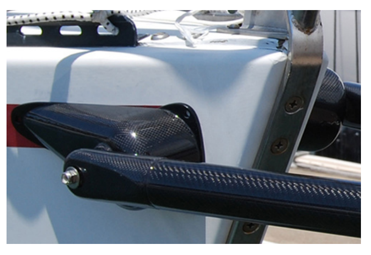
Side Mounts – Designed specifically for narrow bows and bolted through the hull. For the AS40 and AS50 versions only

These are the standard mounting methods however there are thousands of different and challenging bow configurations and we are happy to look at custom installation methods to find the best solution for your boat. To get a free analysis of the options available, please complete our questionnaire and send to us at support@upffront.com