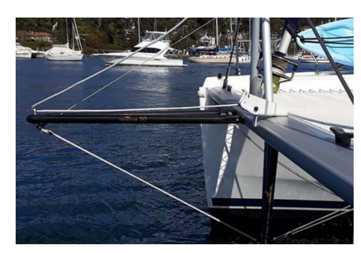
Catamaran Cross Beam – Cat Brackets (for the AS40 and AS50 versions only) are bolted on the forward face of the cross beam. Used in conjunction with a dolphin striker