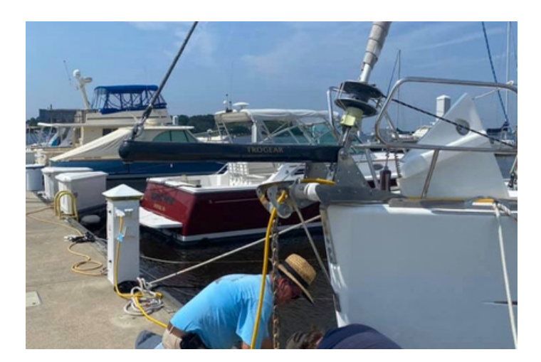
Bow Roller – Generic stainless brackets can be bolted to existing anchor rollers to deploy the bowsprit over the top of the anchor