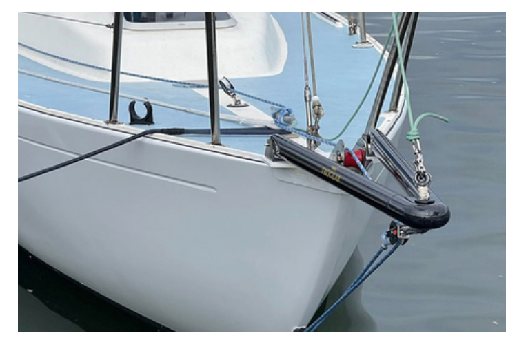
On-Deck – Anodized aluminium U-brackets can be bolted through the deck, close to the outboard edge