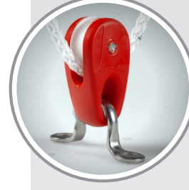
KITE BLOCK on Saddle