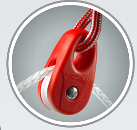
KITE BLOCK on Lashing