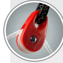
KITE BLOCK on 'Pigtail'