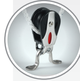
RF20101 on Saddle