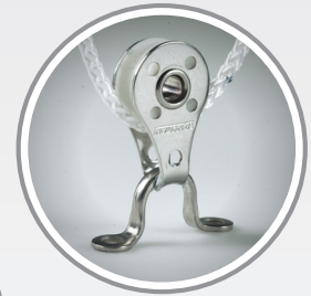
RF666 on Saddle