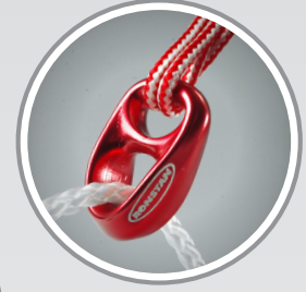
SHOCK on Lashing