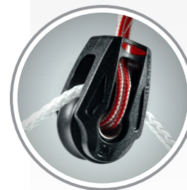
RF25109 on Lashing