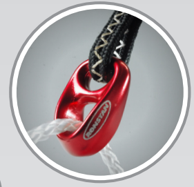
SHOCK on 'Pigtail'