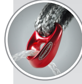
SHOCK on Dyneema® Link