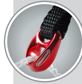
SHOCK on 8mm webbing