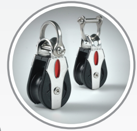
RF20101 with Shackle - 2 ways